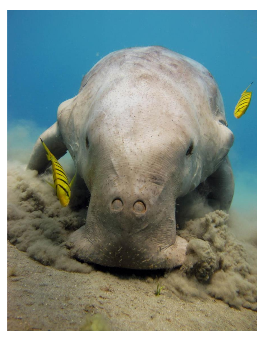
FIGURE 7.25 Dugong dugon feeding on seagrass

Two decades ago it was already apparent that D. dugon was in critical need of conservation intervention (UNEP 2002), particularly in the western Indian Ocean (WWF-EAME 2004). In the absence of anthropogenic impacts, this coastal marine mammal has a low maximum rate of population increase of only 5% per year (Boyd et al 1999); hence, any additional mortality through hunting or accidental capture in nets can tip a small