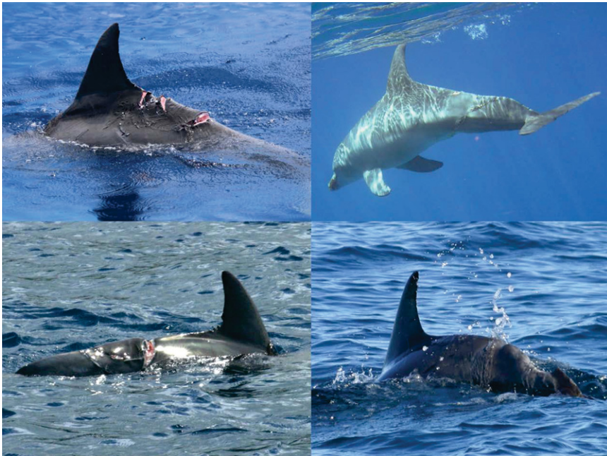
Figure 2. Representative photographs of shark-inflicted injuries on Indo-Pacific bottlenose dolphins ( T. aduncus ) from Réunion.

Injuries to dolphins were assessed from photographs taken during standard photo-identification surveys. We only included individuals in analyses if they were identified based on photo-identification. Therefore, a single individual could not be counted more than once. We considered an injury to be shark-inflicted if it was crescent shaped and/or contained deep and widely spaced tooth impressions that could only have been caused by a shark (Fig. 2). For all individuals included in the sample from all locations, photographs of each individual were available for the dorsal surface and upper flanks of the dolphin from the head to the peduncle on both sides. Therefore, the majority of shark bites on the upper body surfaces likely were recorded. Because previous studies of bottlenose dolphins ( Tursiops cf. aduncus ; Heithaus 2001 b ) and Atlantic spotted dolphins ( Stenella frontalis ; Melillo-Sweeting et al. 2014) suggest