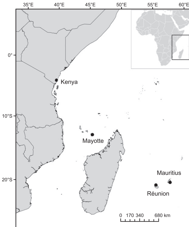
Figure 1. Location of study sites in the southwestern Indian Ocean.

Here, we estimated the proportion of individual Indo-Pacific bottlenose dolphins ( Tursiops aduncus ) bearing injuries inflicted by sharks at four locations in the southwestern Indian Ocean (southern Kenya, Réunion, Mauritius, and Mayotte; Fig. 1) during photo-identification surveys (see Kiszka et al. 2012, Webster et al. 2014 for details). In Kenya, the sampling focused on the Kisite-Mpunguti Marine Protected Area (4°04'S, 39°02'E) and adjacent waters (~200 km 2 ), and was conducted from January 2006 to December 2009. Photo-identification surveys were conducted every month (except from January to June 2008 due to national political conflicts). This area mostly covers shallow waters (0–15 m), including coral reefs, where Indo-Pacific bottlenose dolphins are common (Pérez-Jorge et al. 2015). Mayotte (12°50'S, 45°10'E) is located in the northeastern Mozambique Channel and is part of the Comoros archipelago (Fig. 1). The island is almost entirely surrounded by a 197 km barrier reef, forming the largest coral lagoon in the Indian Ocean and averages 20 m in depth (1,500 km 2 ). Adjacent to the northern part of the lagoon, there is a submerged reef bank ( Iris ) that is about 215 km 2 . Indo-Pacific bottlenose dolphins occur